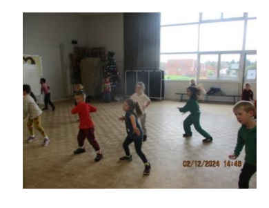
importance of teamwork.

Beech Class has been brimming with creativity, teamwork, and discovery! The children have been fully immersed in a variety of exciting activities across all subjects, showcasing their hard work and enthusiasm. In dance, the children have been working diligently on their routines for an upcoming dance performance. Through this, they have not only been learning technical skills like rhythm, coordination, and expressive movement but also the