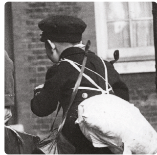
A Child's War